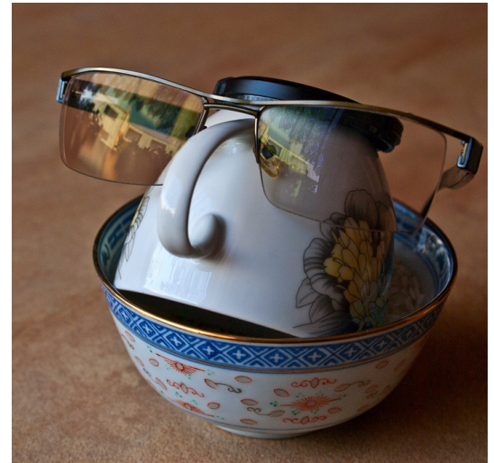
A harmless April Fool's prank with someone's glasses

The date of when April Fool's Day first began is still unknown. However, people believe that April Fool's Day began because of a change in New Year's Day. New Year's Day used to be at the end of March and it changed to January 1st. When this happened, not everyone knew of the change. Those people became known as "April Fools". People would send them to fake parties or on fake errands. This is why April Fool's Day is now full of jokes and pranks, just like the image to the right.